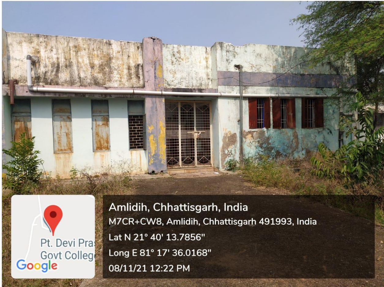
Pipline for rain water